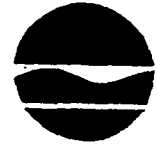
Thomas C. Jorling Commissioner

New York State Department of Environmental Conservation 50 Wolf Road, Albany, New York 12233